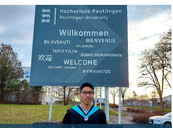
Niak from Taiwan: "The exchange programme allowed me to meet international students and helped me to understand the importance of language and interpersonal skills."